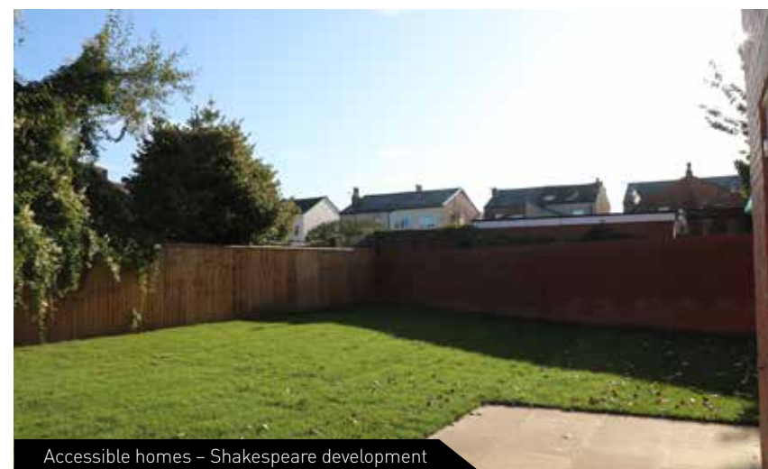
Accessible homes – Shakespeare development