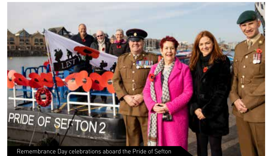
Remembrance Day celebrations aboard the Pride of Sefton

In 2019/20 the Group's Pride of Sefton canal boat also continued sailing providing educational trips for those in our communities.