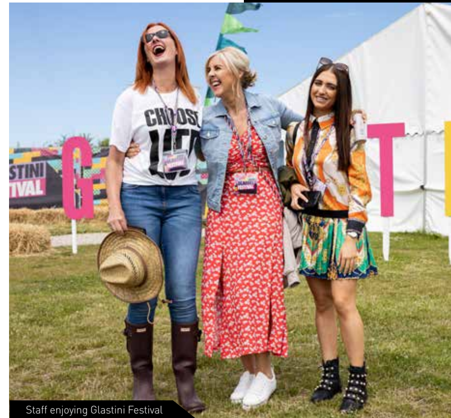
Staff enjoying Glastini Festival