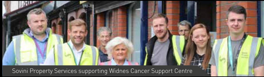
Sovini Property Services supporting Widnes Cancer Support Centre