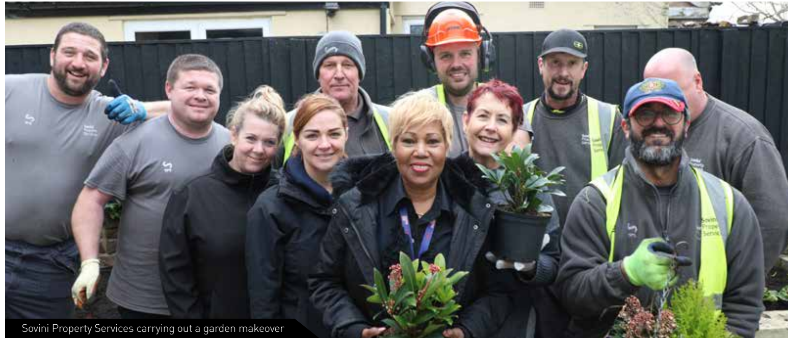
Sovini Property Services carrying out a garden makeover