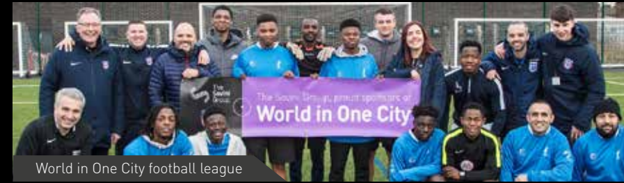
World in One City football league

Our commitment to our communities continued as Sovini Trade Supplies supported local hospice, Zoe's Place Trust. The donations from employees and customers contributed to the Trust's ongoing work to provide palliative, respite and end-of-life care to babies and infants aged from birth to five, suffering from life-limiting or life-threatening conditions.