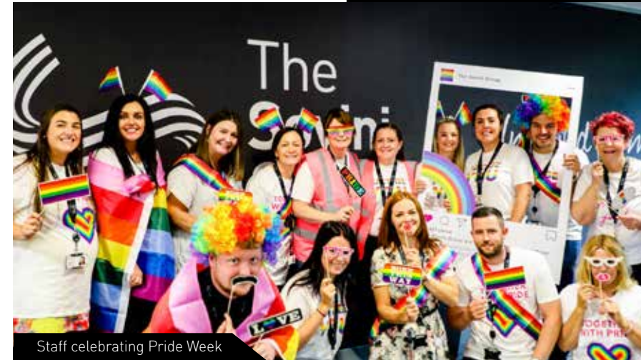
Staff celebrating Pride Week

As part of our employee Health and Wellbeing programme we continually look at new ways to support colleagues to have positive mental health, both in and outside of their working environment.