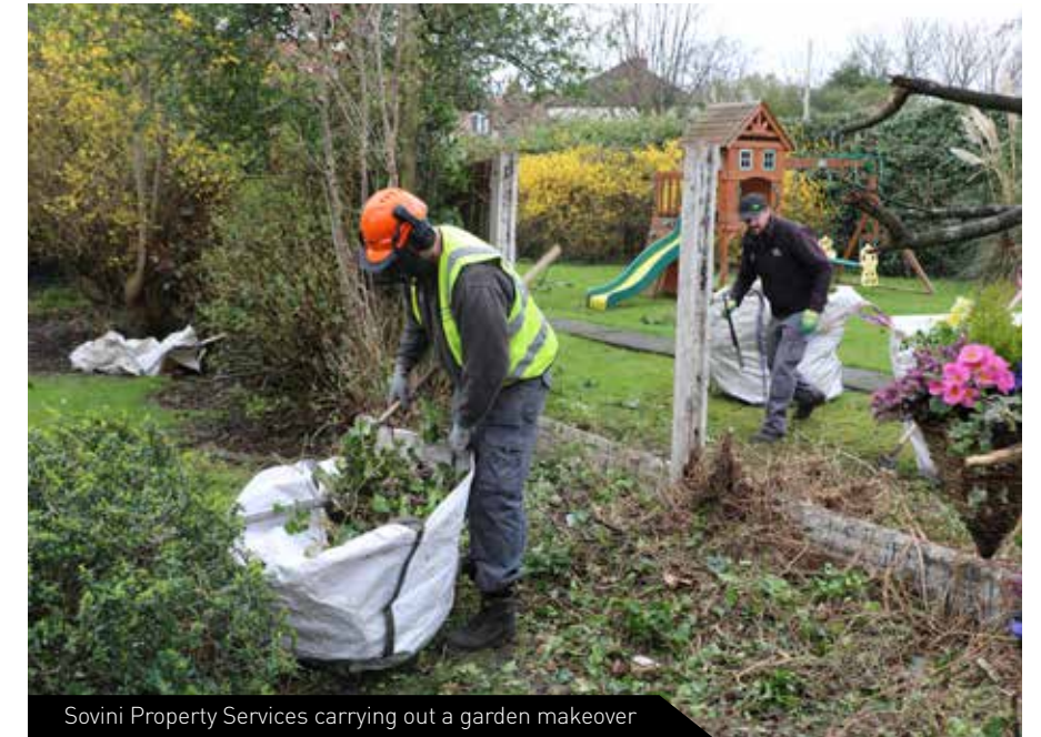
Sovini Property Services carrying out a garden makeover