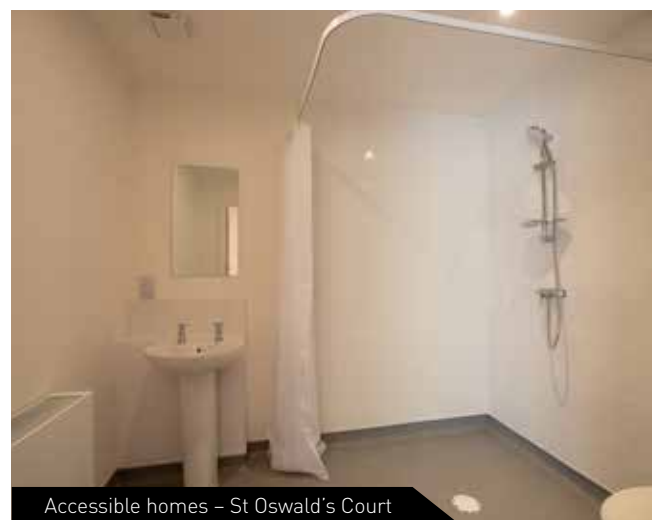
Accessible homes – St Oswald's Court