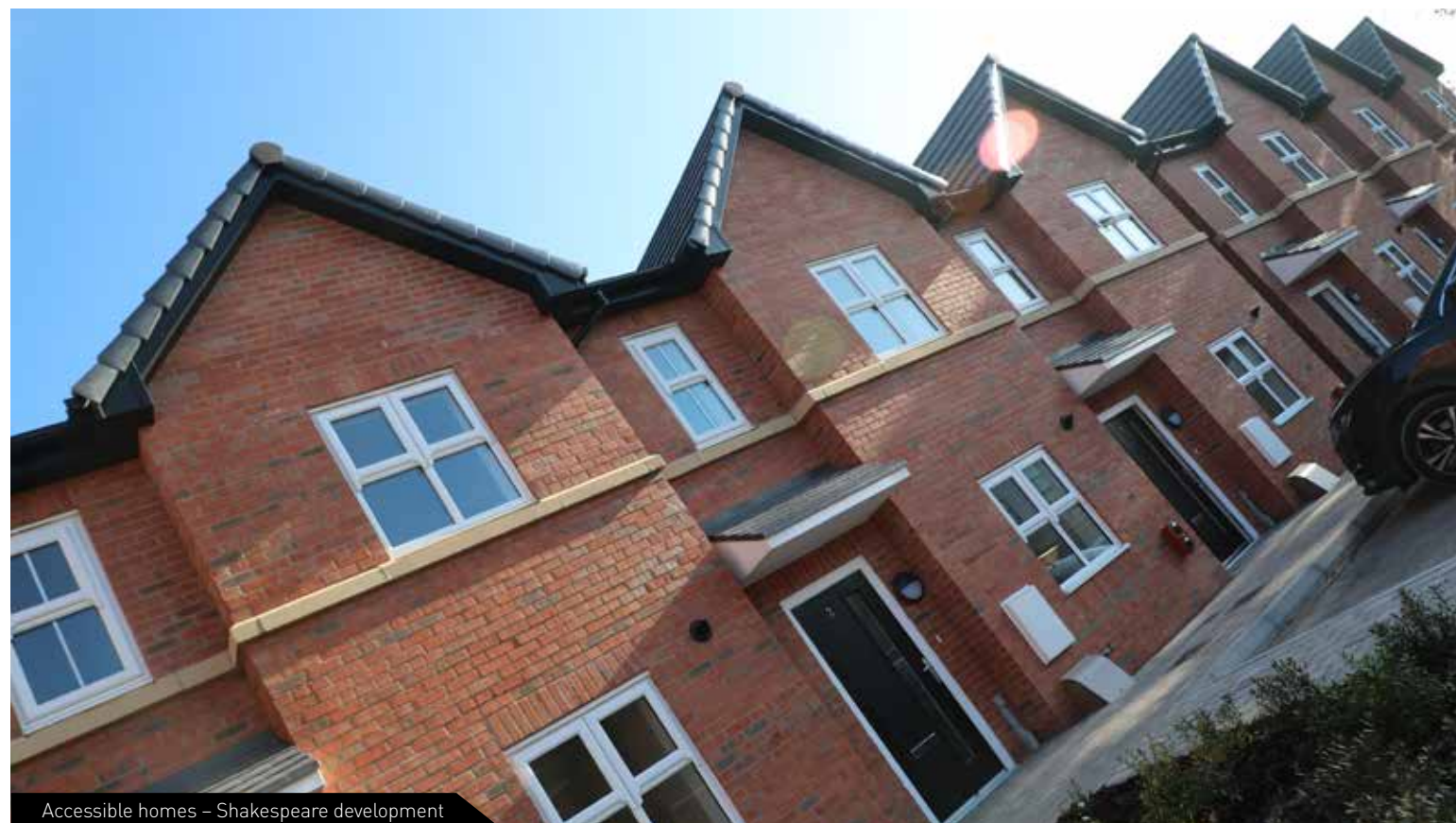
Accessible homes – Shakespeare development